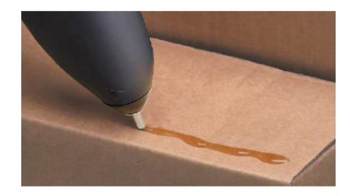
Carton closing and packaging applications, with a robust and reliable design that stands up to repeated use.