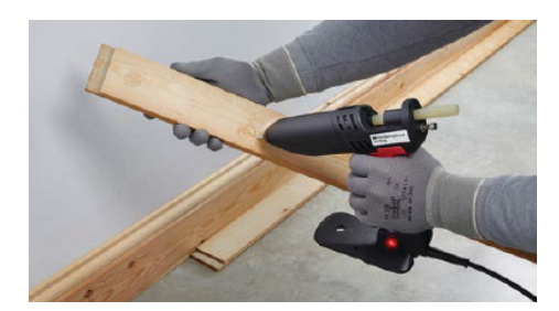
Wide range of woodworking applications, with a good output and smooth operation.